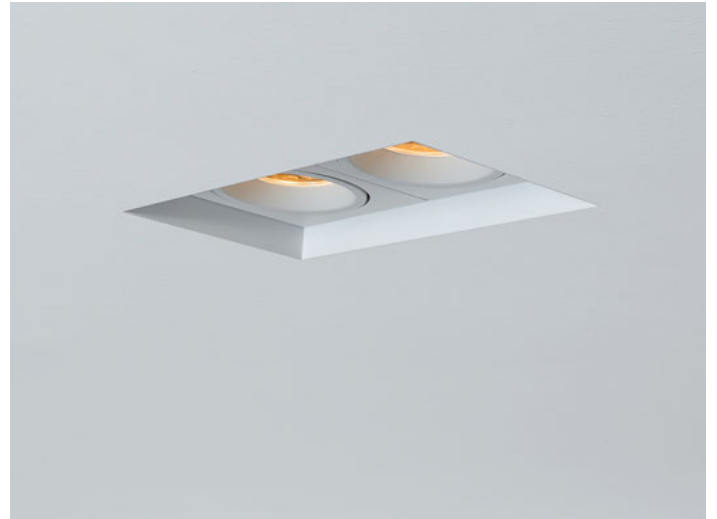
SCANIA Twin Square TS